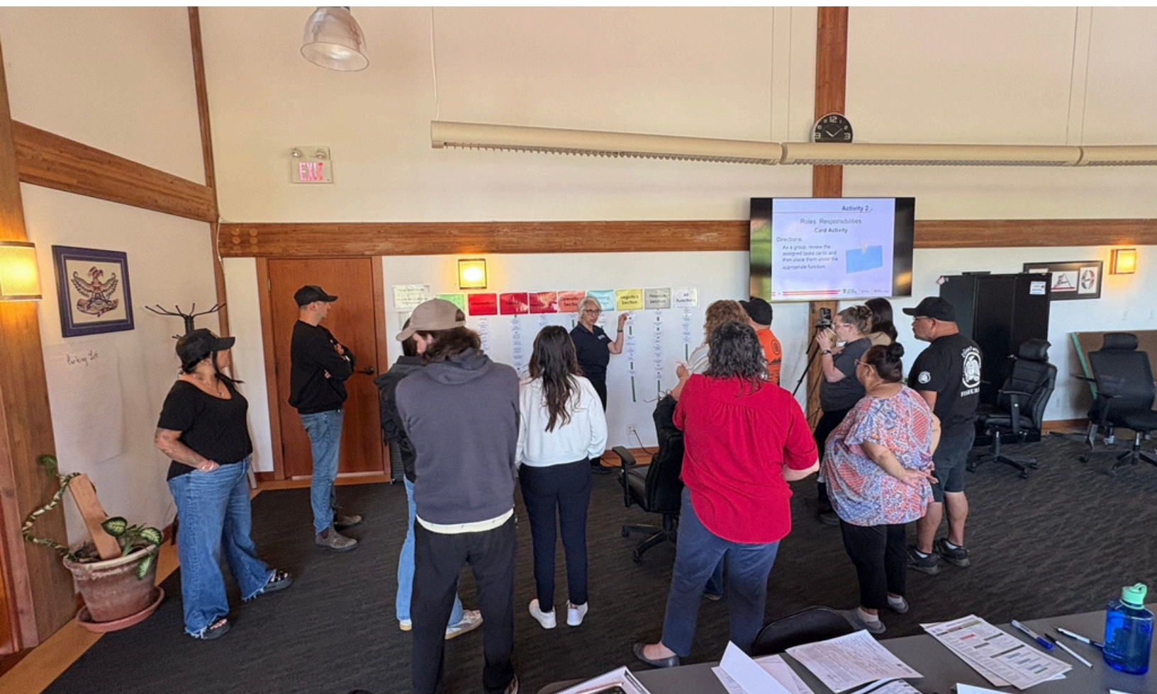
Nations and Organizations participating in EOC training (Photo by Tseshaht First Nations).

Delivered by the Justice Institute of British Columbia (JIBC), the training focused on the core fundamentals of how an EOC functions to support frontline departments during a crisis. Participants explored site support operations utilizing the standardized Incident Command System (ICS) management structure. This framework defines key roles, such as operations, planning, logistics, and finance, ensuring that all can collaborate seamlessly when a disaster strikes.